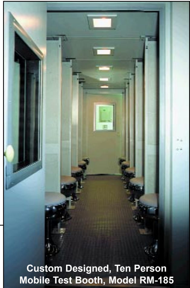
Custom Designed, Ten Person Mobile Test Booth, Model RM-185

Acoustic Systems manufactures a wide range of modular acoustic enclosures for audiology programs. The enclosures offer varying levels of acoustic performance, variations in floor plans, and numerous appearance options. Factory trained sales and service representatives will help you plan your project. Acoustic Systems maintains a NVLAP accredited laboratory (NVLAP Lab Code 100286-0) for constant product research and performance assurance.